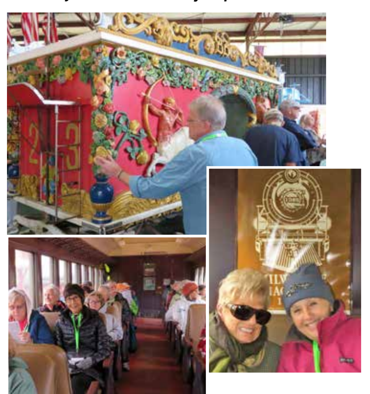
Circus World Museum, International Clown Hall of Fame, Al Ringling Mansion and Theatre, Weatherby Cranberry Co., Discovery Center Cranberry Museum, International Crane Foundation, Mid-Continent Railway & Museu, WI Historical Society Center for Film and Theater Research.