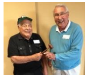
Handing Over the Gavel